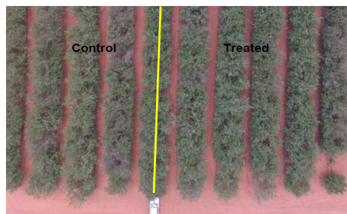
Figure 2 (c): Aerial image taken a nut maturing stage in the almond trial site.