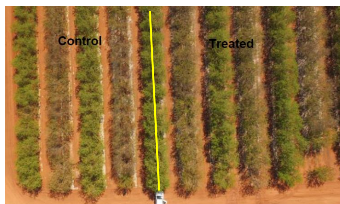
Figure 2 (b): Aerial image taken a fruit set stage in the almond trial site.