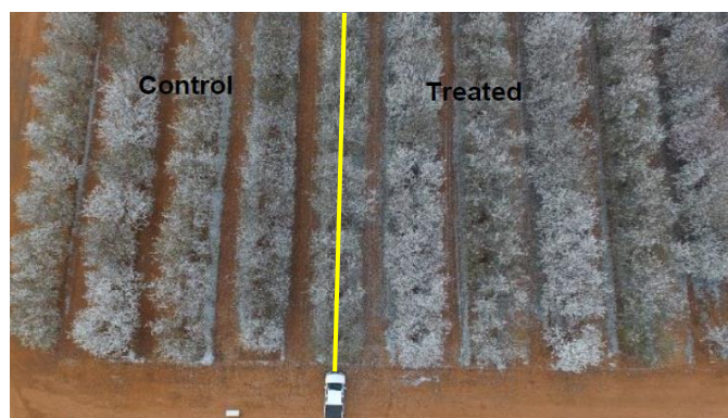
Figure 2 (a): Aerial image taken a full bloom stage in the almond trial site.

photosynthesis, enzyme systems, water movement and seed production. Fe and Mn also determine chlorophyll formation. The amino acids act as chelation agents and have a role in increasing the crop yield and quality. Consequently, higher fruit set and denser canopy resulted in the Transit Foliar treated trees. The aerial images show the three-key bud, flower and nut maturing stages in almonds.