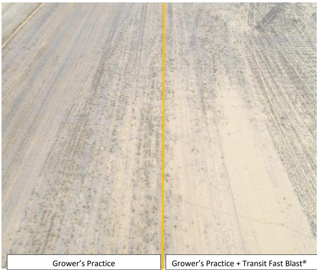
Figure 2: Aerial drone images of the field treated with grower's practice and growers' practice + Transit Fast Blast®.